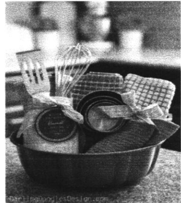
This Photo by Unknown Author is

Fall Conference – Districts 4, 5, 6, 7 Mid-Winter – Districts 8, 9, 10, 11 Conventions – Districts 12, 13, 14, 15